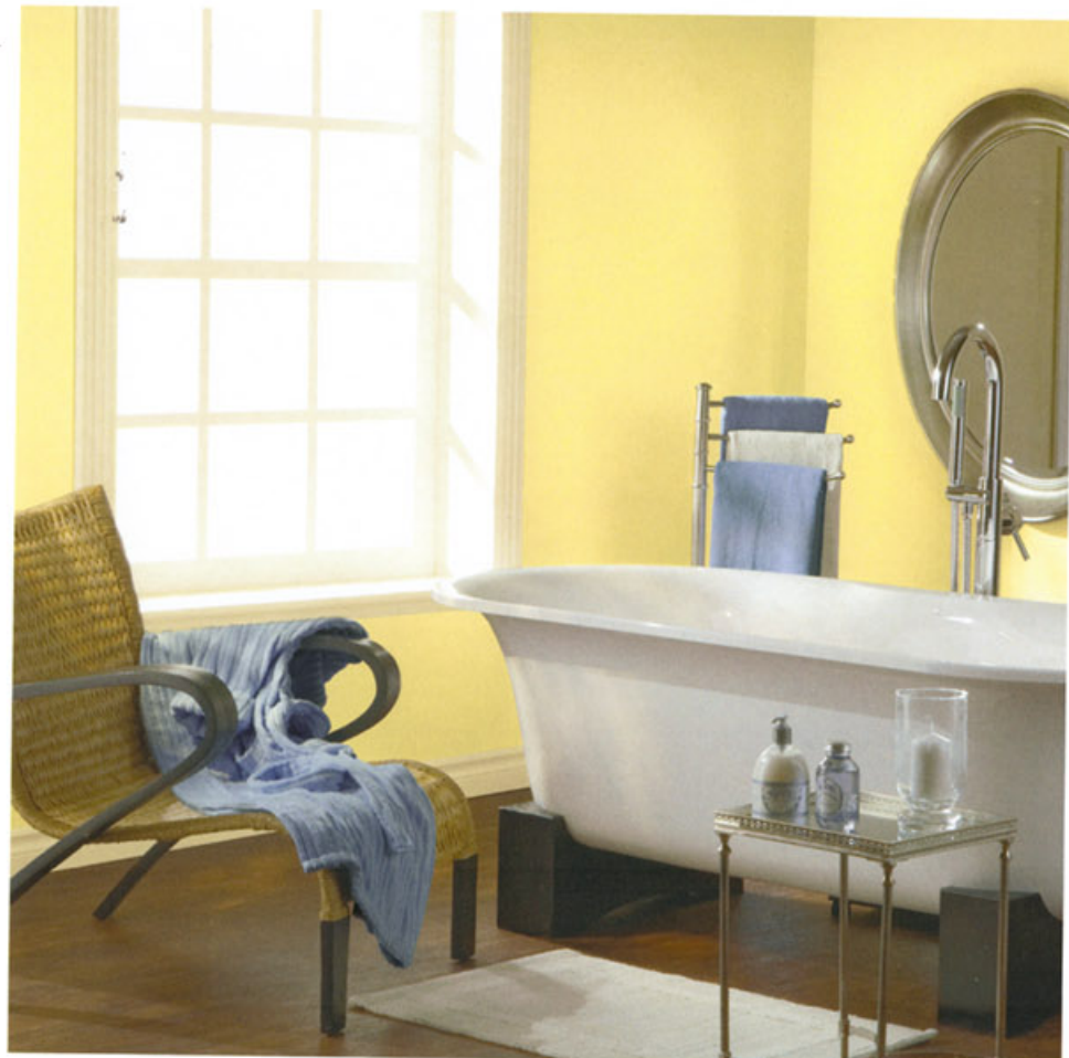
Wall Colour: P5119-34 / cast off

Bask in the warmth. Pleasing and pampering, this palette is as delightful as pulling on the softest robe and stepping out onto warm stone for biscuits and tea in the sun. It's driftwood in the dunes, the sparkle of blue beach glass. It's how to make a space as relaxing and refreshing as the sun-warmed sea.