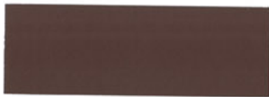
P5239-73 fresh brew

Actual paint colour may vary from sample, depending upon lighting, surface porosity, sheen level, application and age.