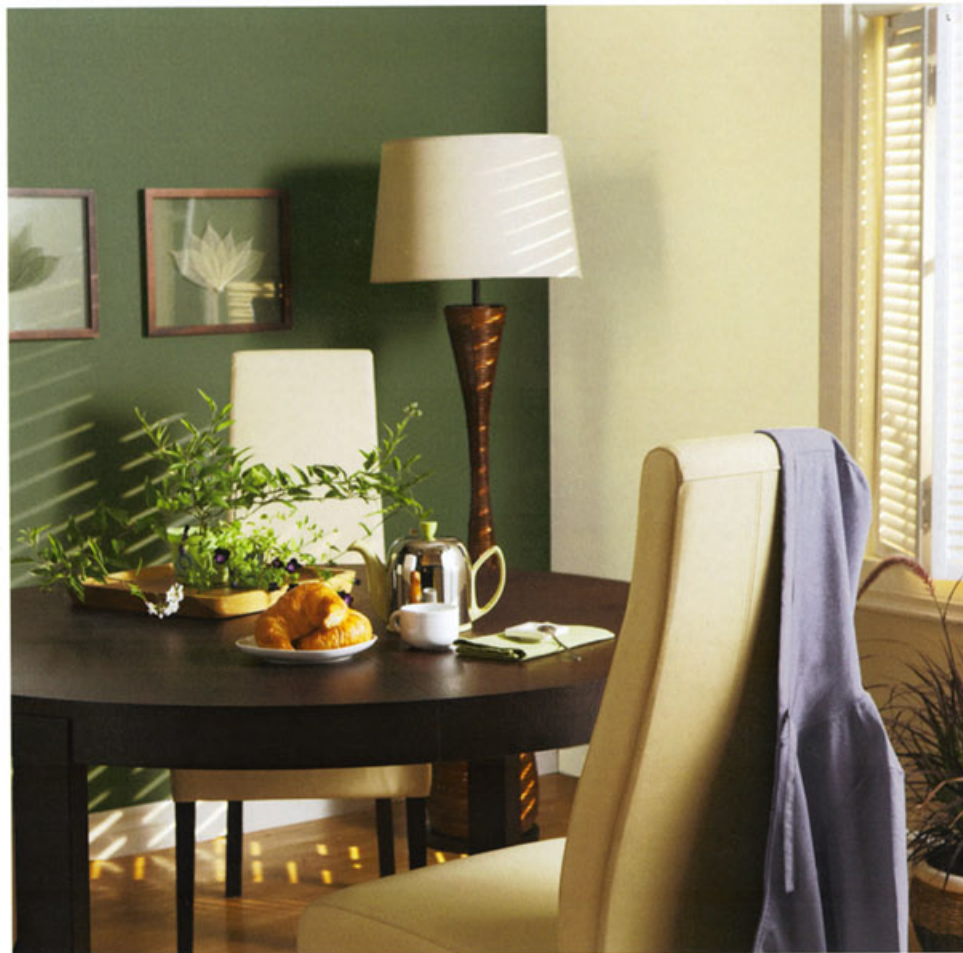
Wall Colours: P5214-62 / enjoy your day, P5224-34 / river rocks