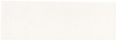
P5223-24 soaker tub