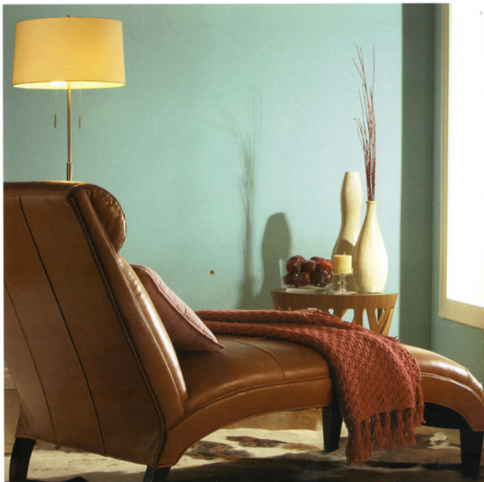
Wall Colour: P5162-34 / riverside rock