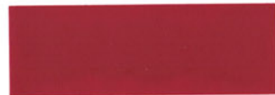
P5079-73* kiss goodnight