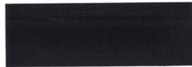
P5204-85 walkin' in the rain

Exhale. Create a space of perfect, sensuous calm after a fast-paced day, with colours reminiscent of fresh, crisp sheets or the touch of cool silk against skin. Magical, misty colours that warm to dark woods and shimmer softly in candlelight. Four parts peace, one part passion, this is your very own boutique hotel.