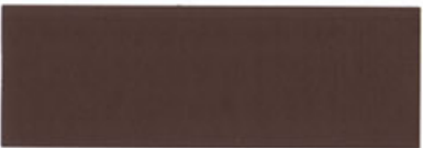
P5240-73 carrriage ride