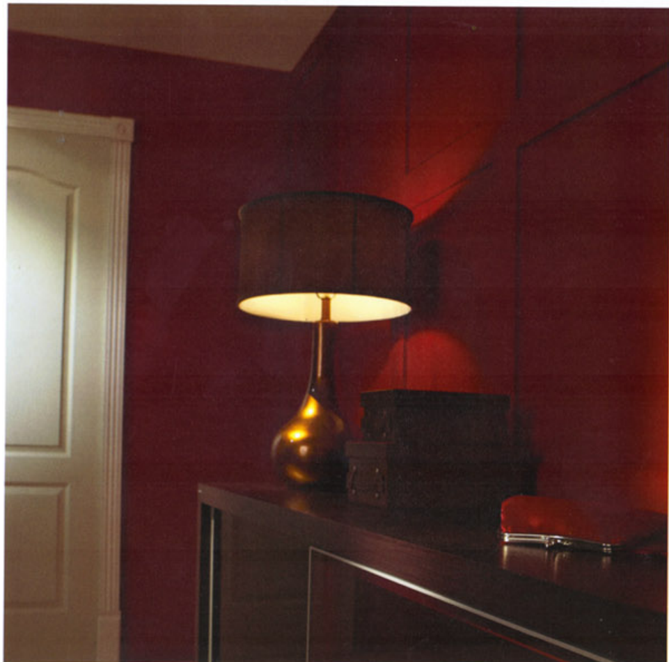
Wall Colour: P5082-85* / schmooze

Make an entrance. As drop-dead gorgeous as the perfect cocktail dress, this velvety palette is instantly alluring. The message is quietly bold, and the feeling is unmistakably confident. Like the strut of couture, these are rich, self-assured colours that let you put together a look that's all drama and grown-up glam.