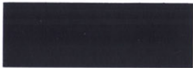
P5247-85 spiked heels

Actual paint colour may vary from sample, depending upon lighting, surface porosity, sheen level, application and age.