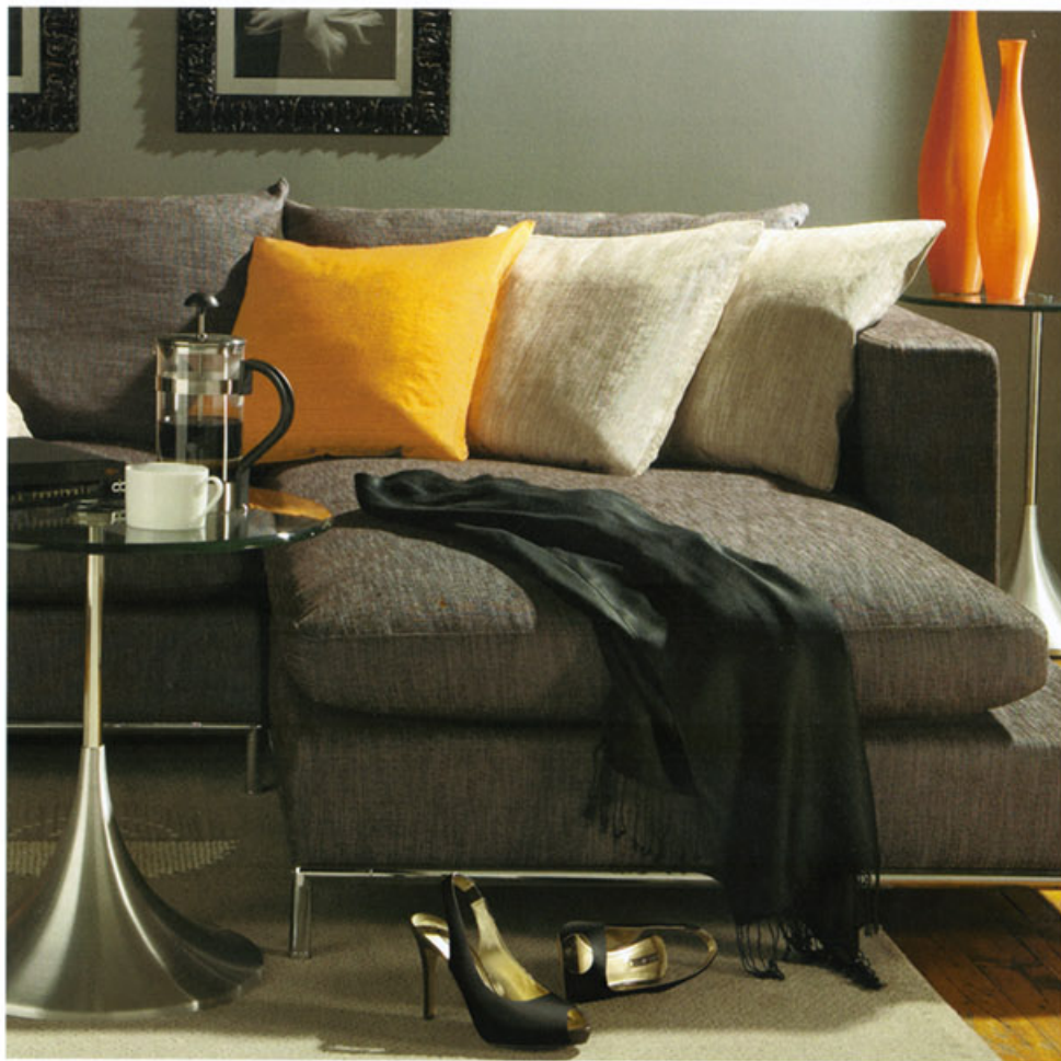
Wall Colour: P5221-41 / film festival