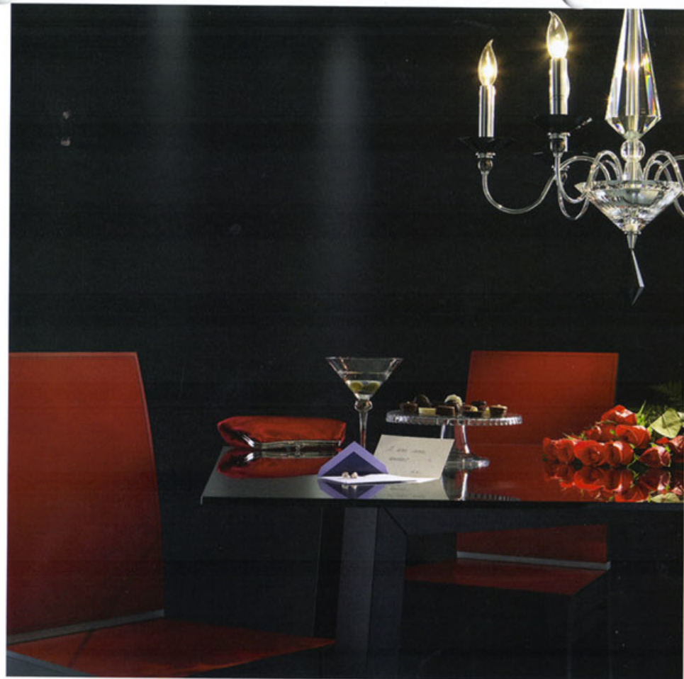
Wall Colour: P5247-85 / spiked heels

Whet your appetite. Bring in the excitement of the night, the glow of the city, and dress your room for dinner. Accent an alcove or wall, or go head-to-toe in colours as deliciously rich as figs and walnuts, as romantic as a stolen glance. Accessorize with sparkle and these new classics say luxury the minute you put them on.