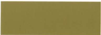
P5116-73 natural beauty