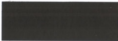
P5220-83 a new chic dress

Actual paint colour may vary from sample, depending upon lighting, surface porosity, sheen level, application and age.