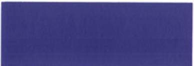
P5003-75 night sets in