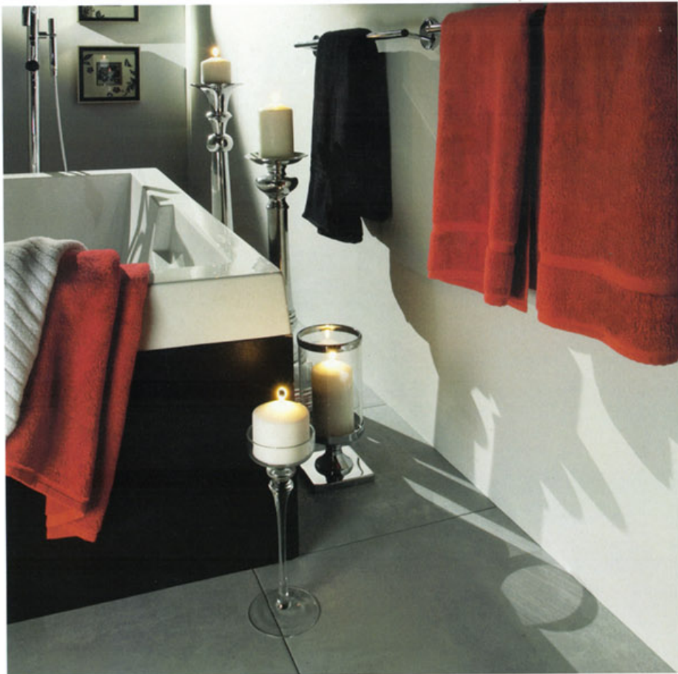
Wall Colour: P5205-14* / nightcap