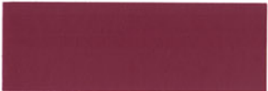
P5088-83 centre stage