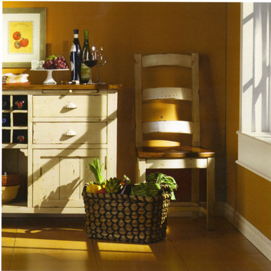
Wall Colour: P5126-85 / dined late

Take it alfresco. Rustic and gregarious, this is a palette of ancient, baked stone and crushed grapes, of rugged, sun-tanned hands kneading dough on Siena linen, and the smell of cypress and sage on the wind. It's an embrace of Old World warmth... a feeling as delicious as a drizzle of golden amber honey on reggiano.