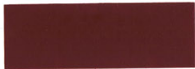
P5187-85 nairobi red

Be wild and free. Create exciting, mysterious places with the colours of ochre dust, Serengeti grasses and a lion's mane. Add sinuous, sculptural forms and rich, oiled woods. And the flash of white, like lightning on the plain. Explore uncharted territory with an organic, primal palette that lets you dance to your own beat.