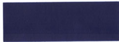
P5007-85 breath taking views