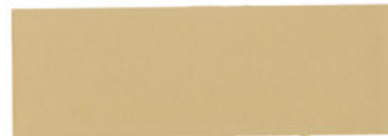
P5118-42 tribal dance