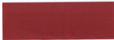
P5078-73 scorching hot

Be mesmerized. Imagine a deep ruby silk dress with an amethyst pashmina, light as a hummingbird. Dream of arabesques, arches and India ink. Revel in intense opulence, iridescent threads, the sheen of brushed silver. Pungent, sultry and saturated, this is a palette as heady as jasmine under a full eastern moon.