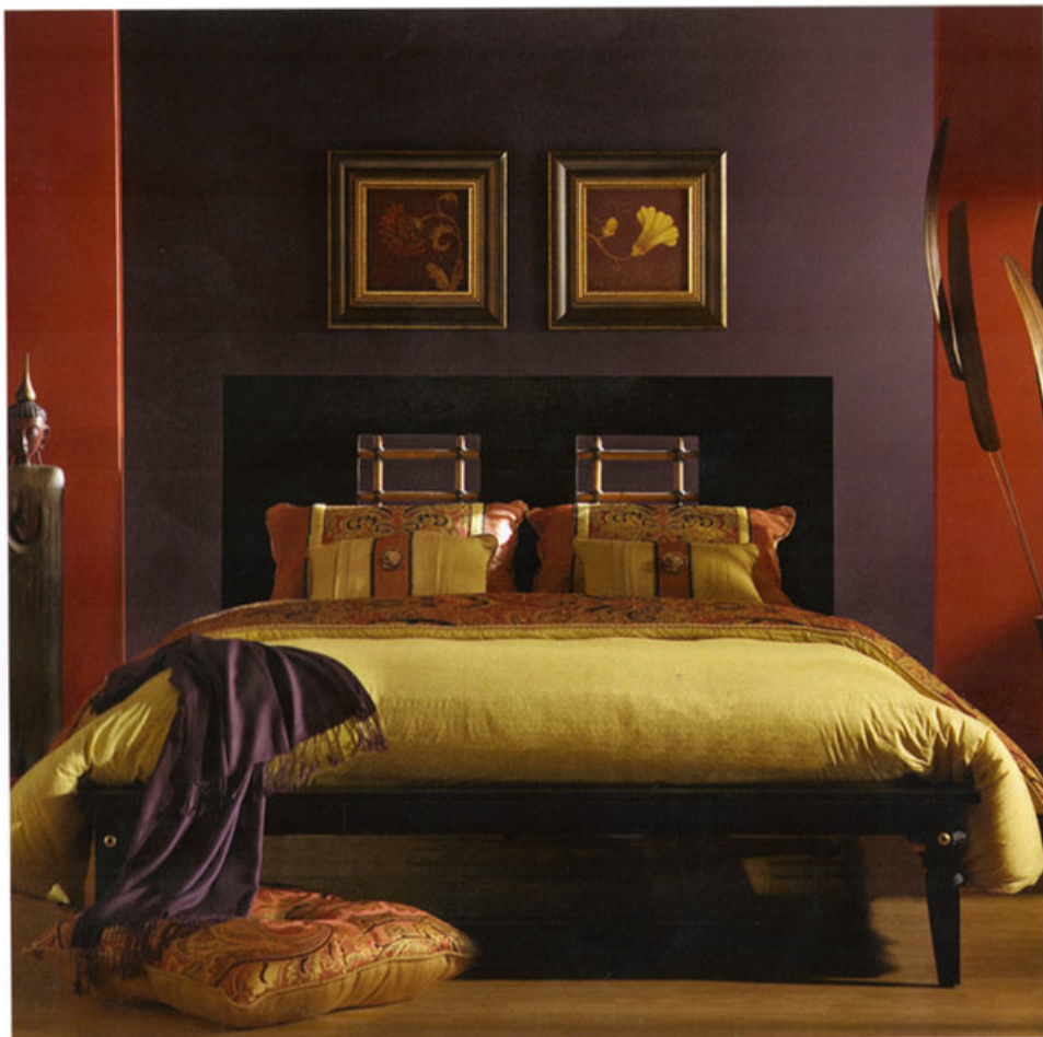
Wall Colours: P5147-85 / persuasion, P5078-73 scorching hot