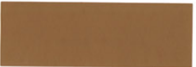
P5178-73 fresh croissant