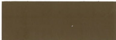
P5216-73 far from shore

Actual paint colour may vary from sample, depending upon lighting, surface porosity, sheen level, application and age.