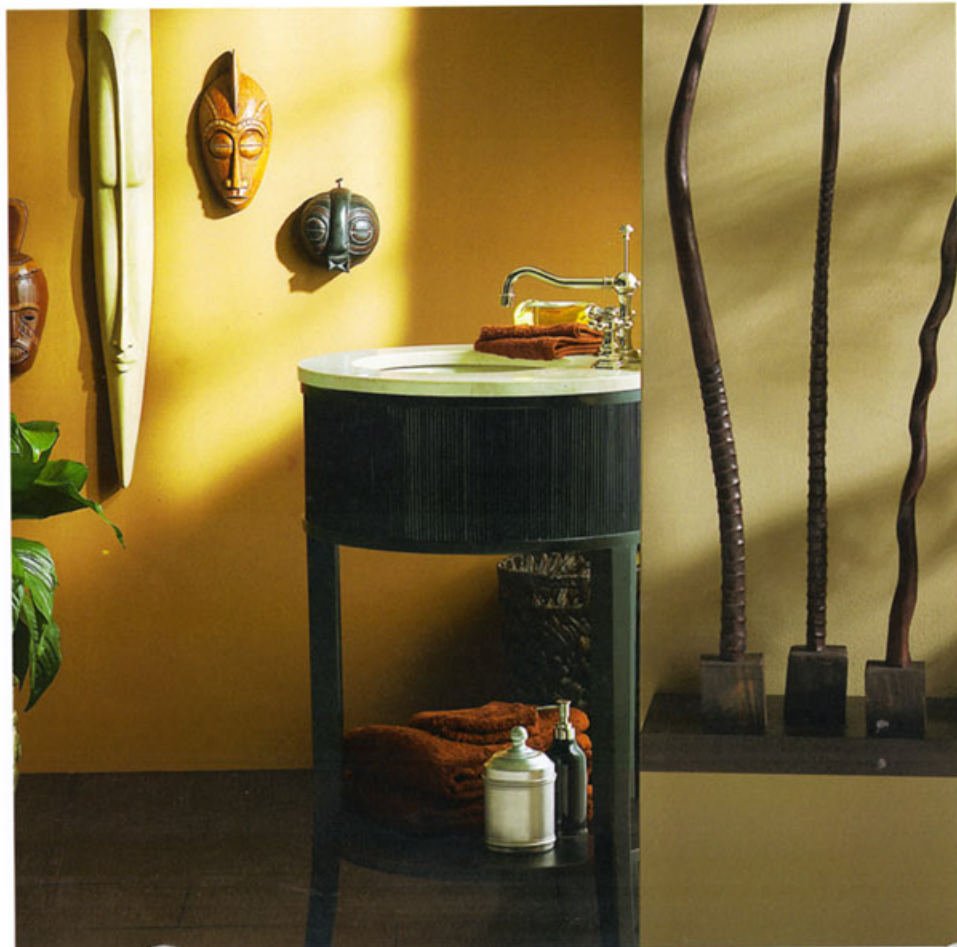
Wall Colours: P5224-51 / tiger safari, P5127-75 aged pathways