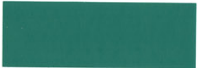
P5019-75 deep end