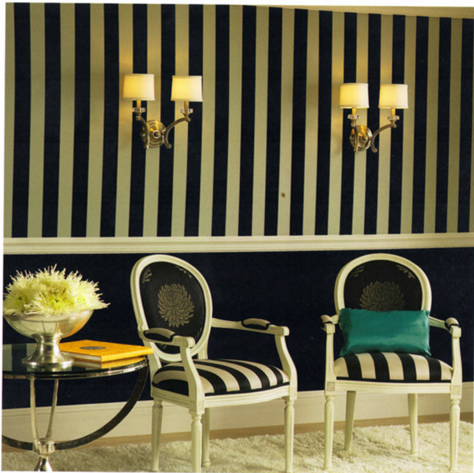
Wall Colours: P5012-85 / fusion, P5213-44 / fashion shoot

Let them eat cake. Banish neutrality with a palette as richly flamboyant as Louis himself. Dare these deep colours with the boldness and allure of a Paris runway, accessorized with satin damask, sapphire and burnished gold. Use lighting for dramatic effect. Startling and luxurious, this is designing with unbridled passion. Magnifique!